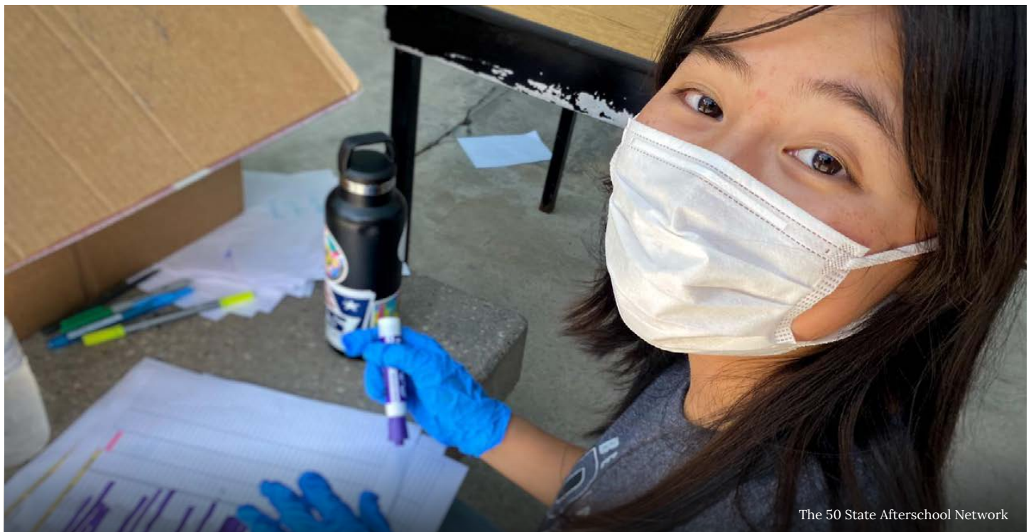
The 50 State Afterschool Network