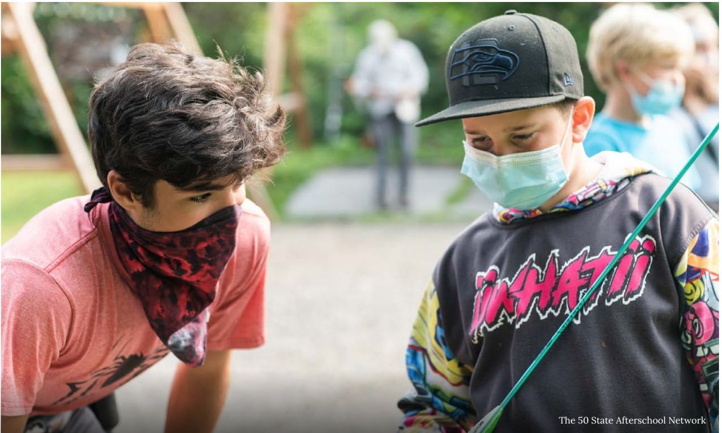
The 50 State Afterschool Network