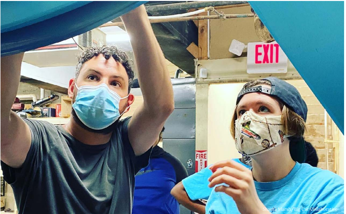
Shauta Marsh/Big Car Collaborative