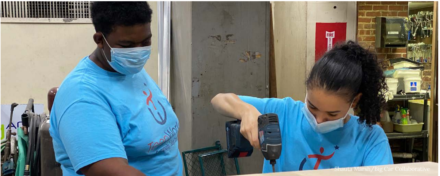
Shauta Marsh/Big Car Collaborative