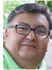
21ST CCLC DIRECTOR, SANTA FE PUBLIC SCHOOLS