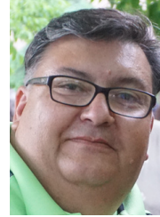
DIRECTOR FOR 21ST CCLC & SUMMER LEARNING, SANTA FE PUBLIC SCHOOLS